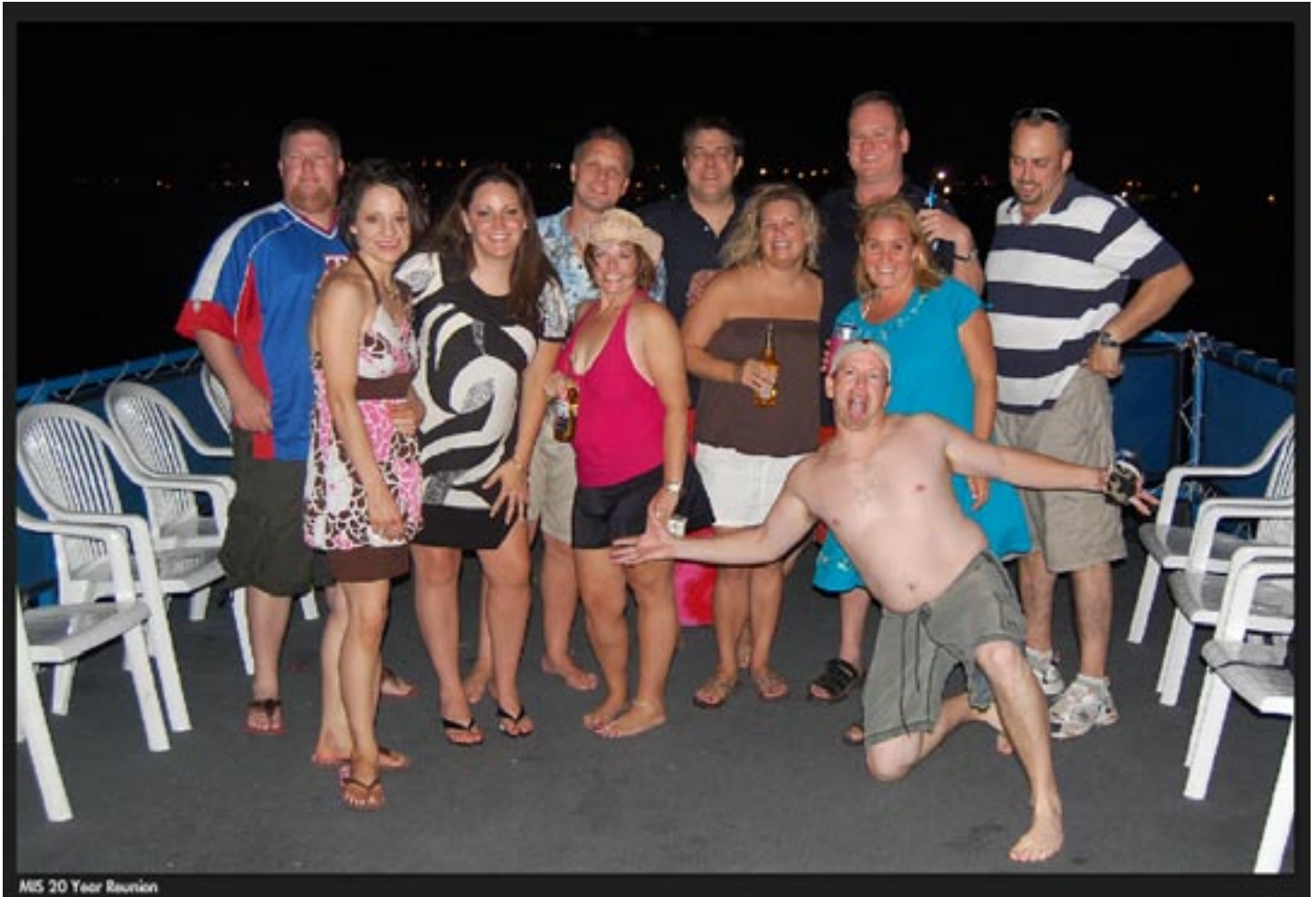
MIS 20 Year Reunion