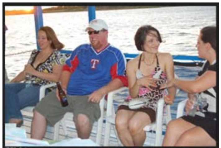
MIS 20 Year Reunion