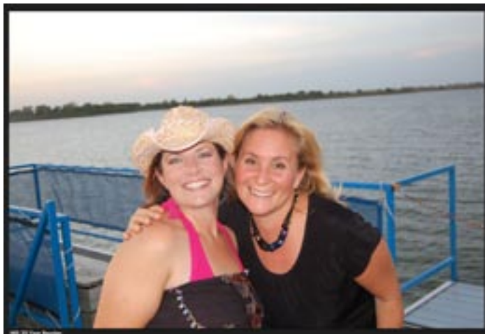
MIS 20 Year Reunion